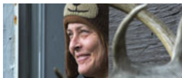
Interview: Sue Aikens of NGC's Life Below Zero: The Thaw