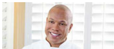
Chef Jeff Henderson helps people "Flip My Food"