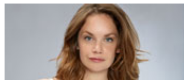
The Affair: Showtime's irresistible drama puts infidelity in complex perspective