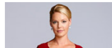
Katherine Heigl calls her "State of Affairs" role "off the rails"